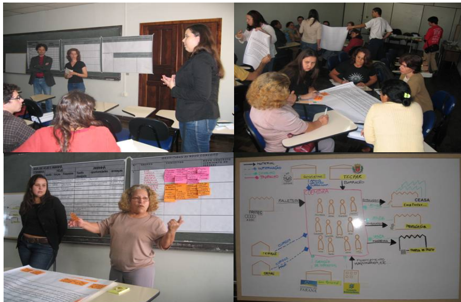
Fig. 3 Images of the workshop at ITCP-UFPR, with the COEMBRA cooperative, in Curitiba, facilitated and promoted by Carlo Vezzoli in August 2006.

The results are very promising and the idea is to extend with a financed project this approach and study to all the network of incubators in Brasil.